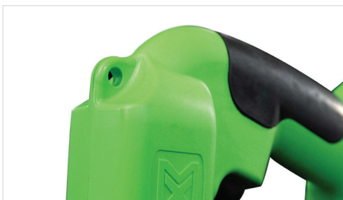
Harness / tether hole